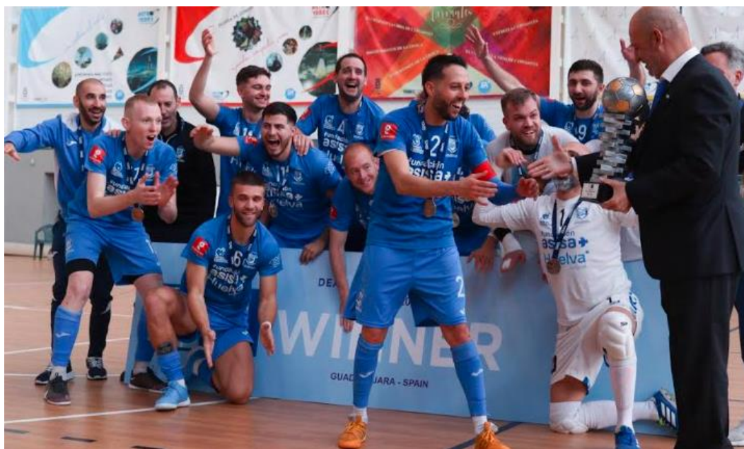
MEN - C.D.S. HUELVA (Spain)